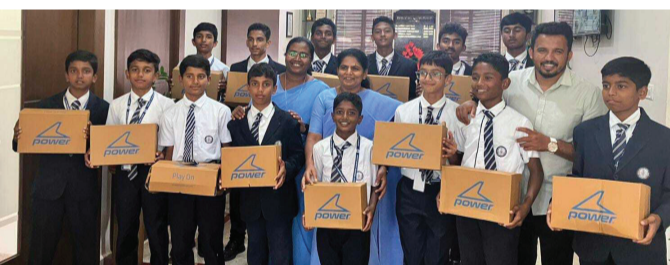
Athletes with the principal and the coach