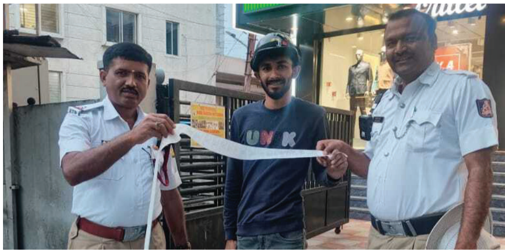
A commuter clears the fine successfully

Diana Saldehna BENGALURU: The 50% discount scheme introduced by the Bengaluru Traffic Police (BTP), in effect from August 23 to September 12, has turned out to be a win-win for both the public and the police. In just three days since the launch, BTP collected ₹11.75 crore in fines, clearing more than 4.17 lakh pending cases across the city. For thousands of vehicle owners, the scheme has come as a much-needed breather. Old fines that once seemed like an unending burden can now be settled at half the cost, giving families both financial relief and peace of mind. For the police, it has meant the recovery of long-pending dues, strengthening enforcement and improving compliance. The response has been overwhelming, with motorists lining up in large numbers to take