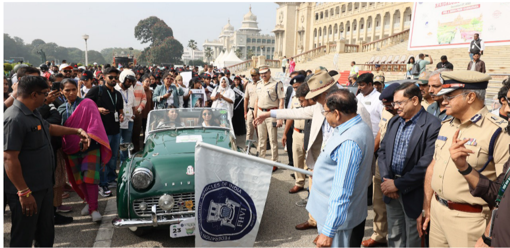
HM Flagging off Vintage Car Rally 2025

BENGALURU: The Vintage Cars Rally 2025 event brought together thousands of people from across Bengaluru in support of a drug-free Karnataka on December 7. Students, citizens, and government officials participated enthusiastically, demonstrating the city's strong unity in the fight against drug abuse. Organised by Bengaluru City Police in collaboration with the Federation of Historic Vehicles of India (FHVI) and Paul John Hotels & Resorts, the rally began as a showcase of vintage cars but soon grew into a meaningful awareness campaign. Starting at the steps of Vidhana Soudha and ending at the Big Banyan Tree Ranch Resort, the 35-kilometre route was lined with people cheering, taking