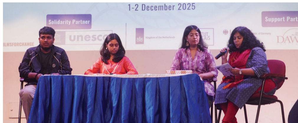
Student moderators from Rushes Film Society lead a panel discussion during the Film Festival