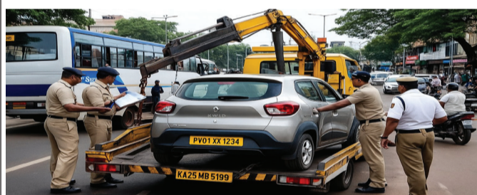
Karnataka police seizing vehicle registered in Puducherry X

In a post on X, a user shared a picture of Karnataka police seizing vehicles registered in Puducherry and other states for operating in the Hubballi-Dharwad region without paying Karnataka State taxes. Transport Minister Ramalinga Reddy ordered to