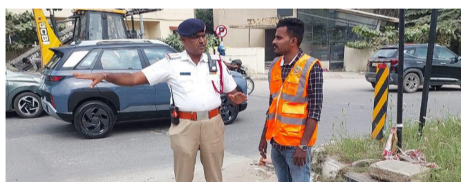
Traffic police guiding the participant