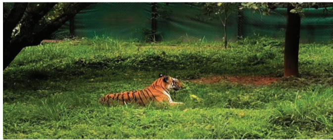
Tiger in Bandipur Tiger Reserve

This re-opening, authorised by Forest Minister Eshwar Khandre on Thursday, ended the 3-month ban imposed in November following fatal tiger attacks. Stakeholders estimated that the local eco-