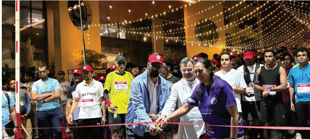
Neerathon 2026 flag-off