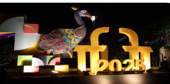
Photo-point of IFFI at Goa