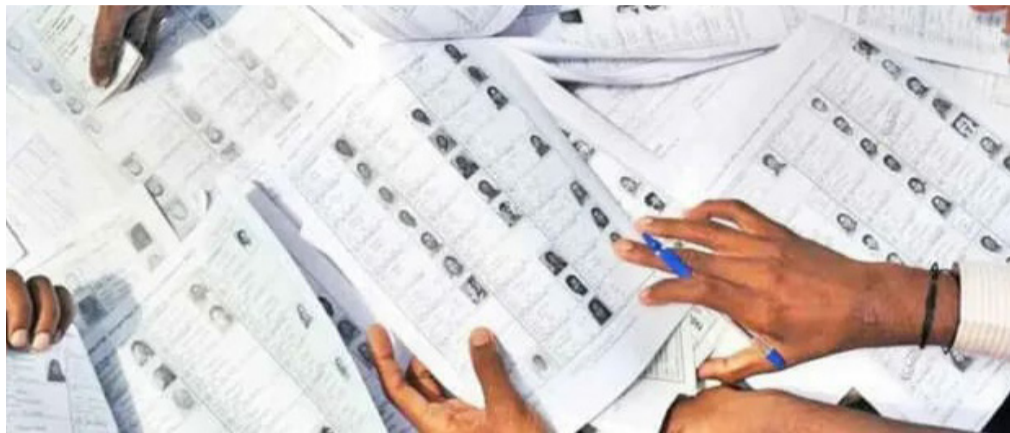
SIR in progress in Kerala

Both these processes are quite complicated, with the elections covering over 23,600 wards and